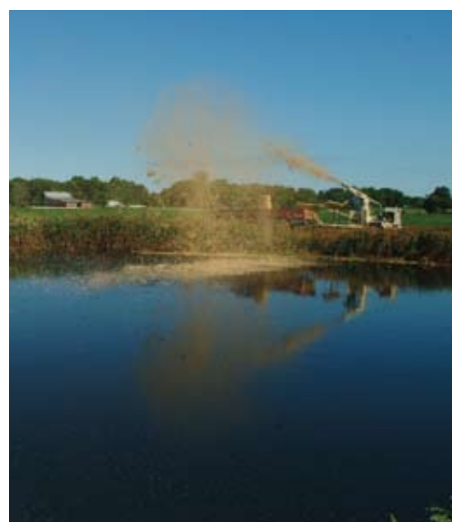
Lagoon being covered with straw to mitigate odor