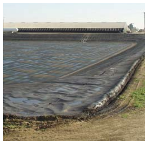
Geotextile covered lagoon

Some permeable covers, such as those made with blown straw or cornstalks will last for two to six months depending on the manure slurry thickness and the weather. The thicker the slurry, the longer the straw will float. Rainfall on these covers causes the cover to sink faster as well. While short-lived, straw covers are cheap and are effective while they are in place. Research has shown that a four-inch straw cover will provide