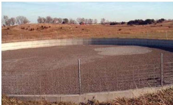
LECA covered lagoon

To learn more about odor mitigation practices, visit the Checkoff-funded Air Management Practices Assessment Tool at http://www.extension.iastate.edu/airquality/practices/homepage.html .