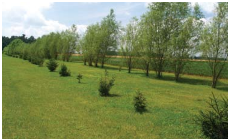
Windbreaks help dissipate odors